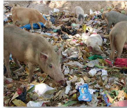
Feeding on garbage