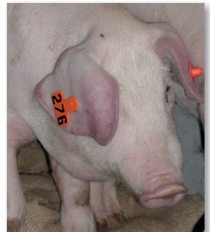
Reddening of the tip of the ears