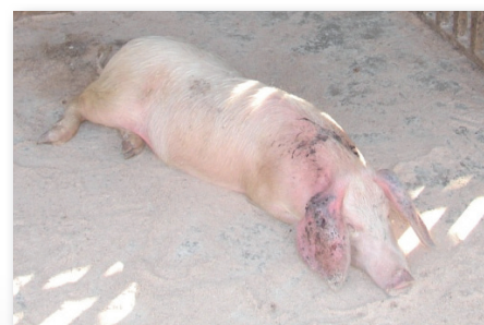
Decreased appetite, listlessness, cyanosis and mobility incoordination within 24-48 hours before death