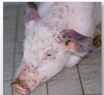
Domestic pigs credit: JM Gourreau