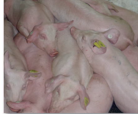
Sudden death of animals with few signs