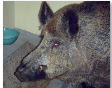
European wild boars