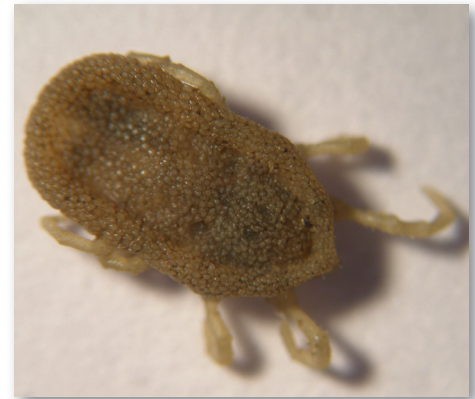
Ornithodoros spp.